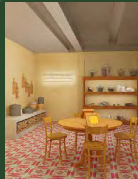
An artist's impression of the Chetti kitchen

Need a break from the mouth-watering prospects? You can test your gaming skills with a fun session of cherki , or listen to some community experts speak about their food heritage!