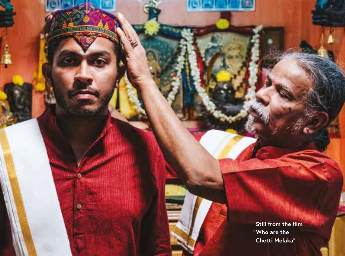
Still from the film "Who are the Chetti Melaka"