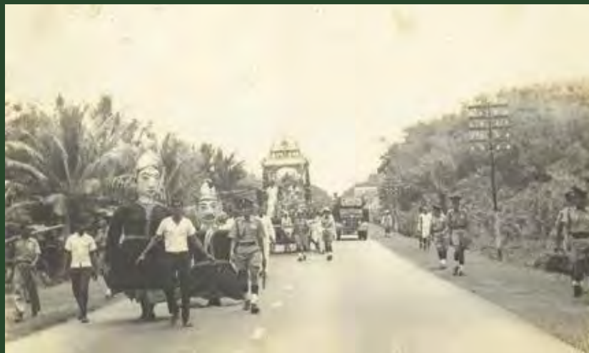
Photograph of the Mariamman Temple ratham procession with Hantu Tetek figures at the front 1970s, Melaka, Malaysia